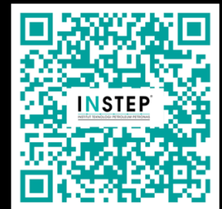
Scan QR code for virtual tour