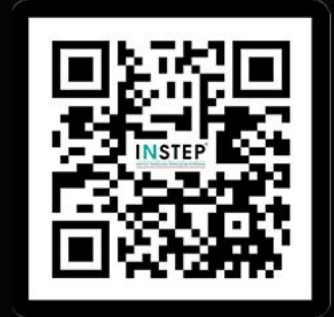
Scan QR code for website