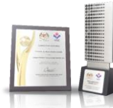
HUMAN RESOURCES DEVELOPMENT AWARDS 2017 Data Analytics Category