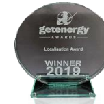
GLOBAL GETENERGY AWARD 2019 Localisation Award