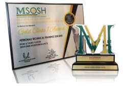
MALAYSIAN SOCIETY FOR OCCUPATIONAL SAFETY & HEALTH GOLD CLASS 1 AWARD 2017, 2018 & 2019