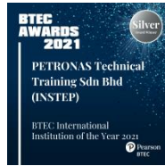
BTEC International Institution of the Year 2021 Silver Award

Enriching the quality of programmes & instructors through domestic and international accreditation & certification