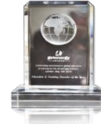
GLOBAL GETENERGY AWARD 2016 Education & Training Provider of The Year